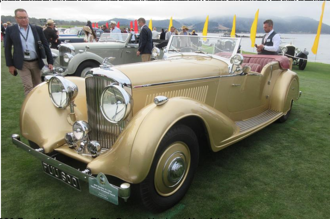
1939 Bentley Vanden Plas. of elegance and beauty. and this golden 1939 Bentley Vanden Plas is another piece of