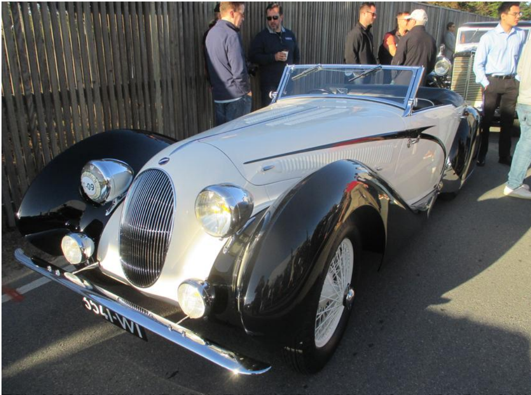
540K 1936 Mercedes-Benz 540K Erdmann and Rossi Special Roadster 1936 Mercedes-Benz 540K Erdmann and Rossi Special Roadster