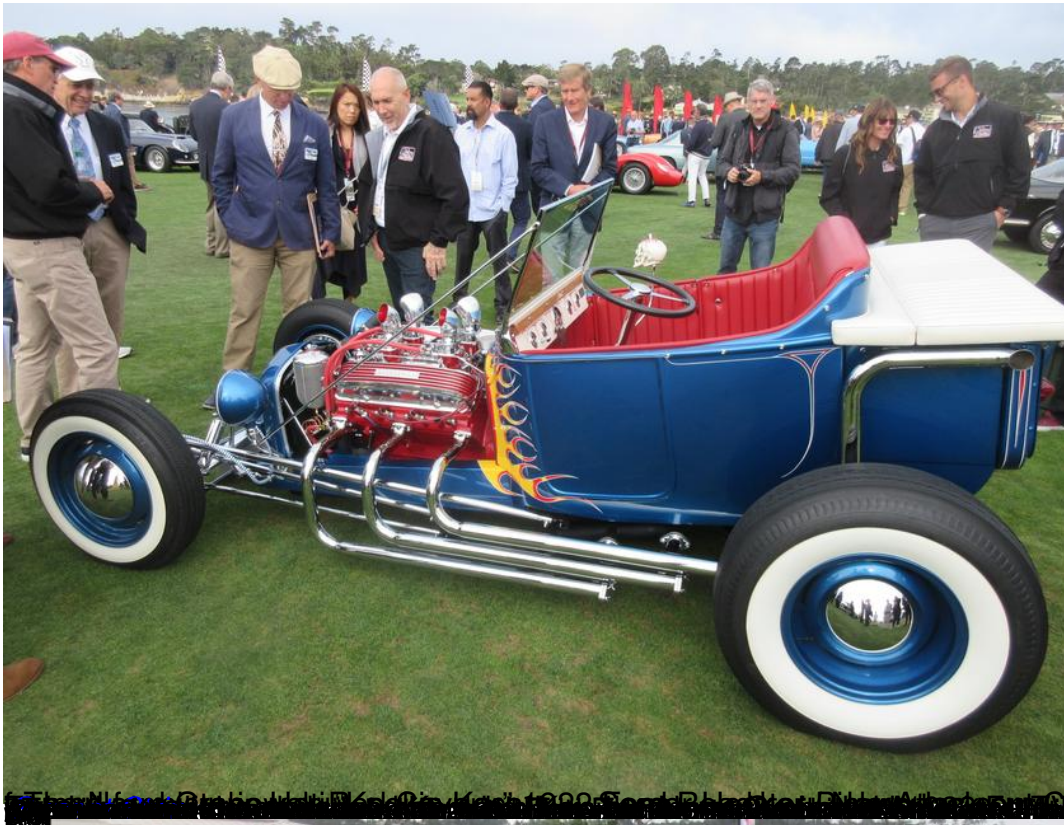
1927 Ford Ed Roth Roadster. The Outlaw. Some included.