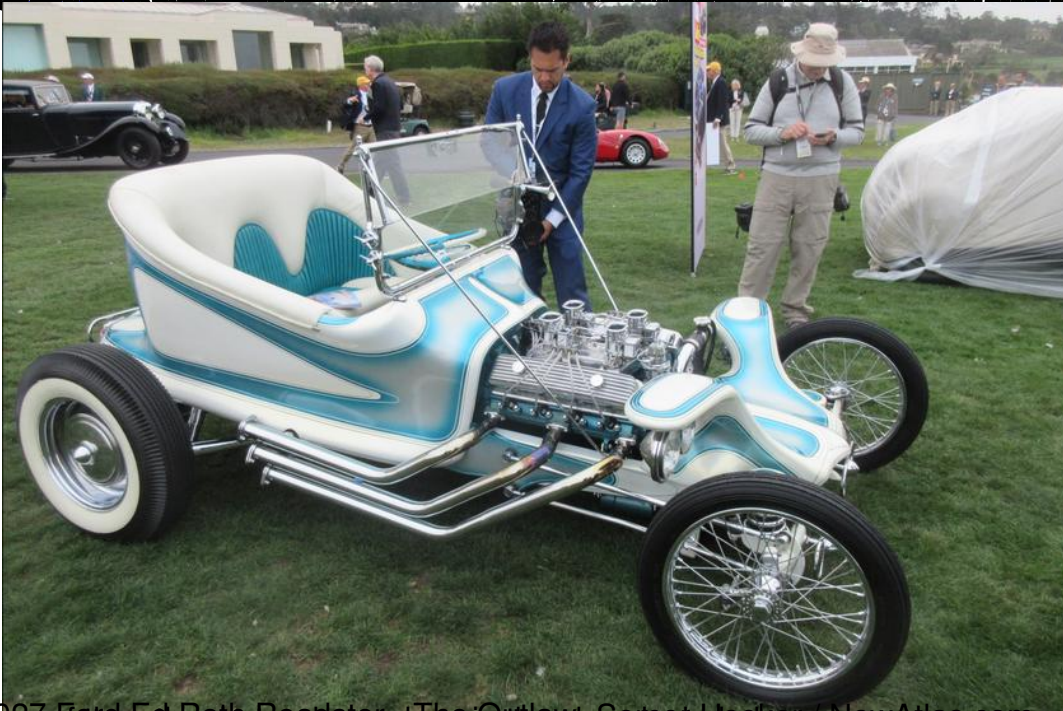
1927 Ford Ed Roth Roadster. The Outlaw. Some included.