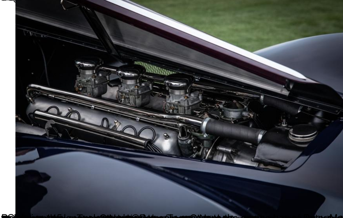
The winner of the 1908 New York to Paris "Great Race"