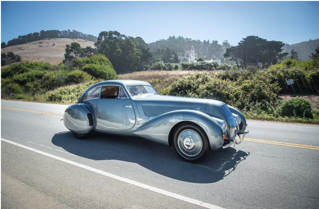
1939 Bentley Continental 4471 cc. 100 mph. Continental from the Kelly Collection at The ...