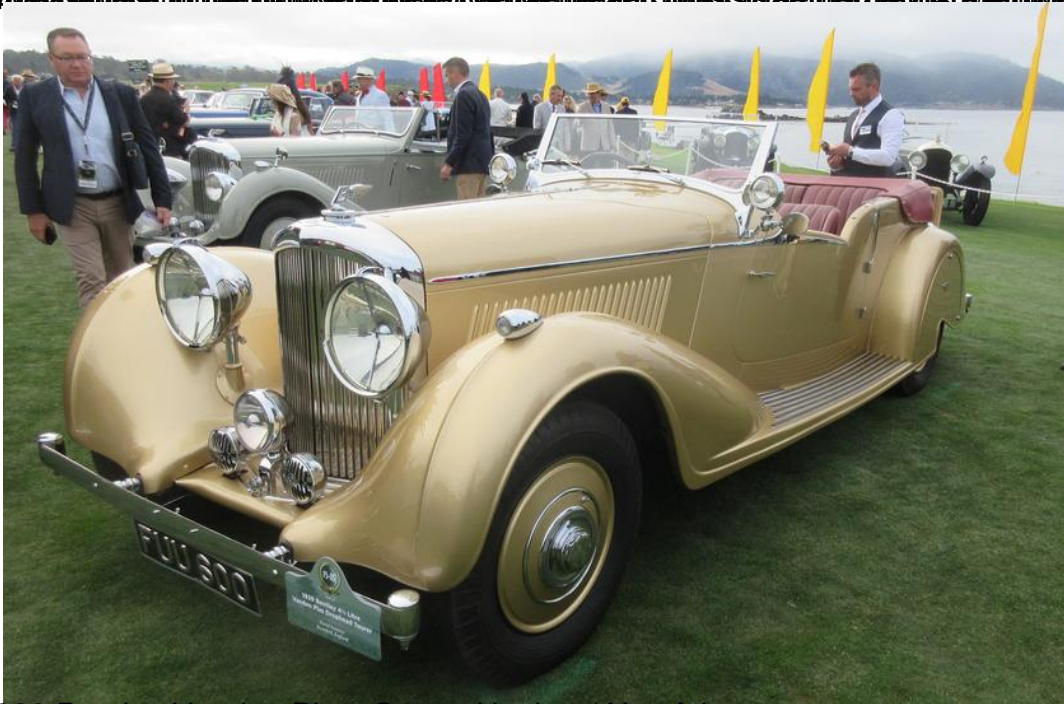
1939 Bentley Vanden Plas. of elegance and beauty. and this golden 1939 Bentley Vanden Plas is another piece of